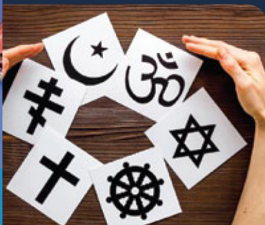
RELIGION AND SOCIETY