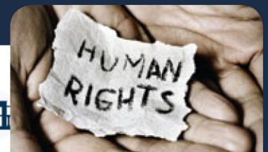
CONSTITUTION AND HUMAN RIGHTS