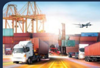
TRANSPORT AND LOGISTICS SERVICES